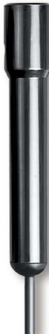
Conductivity/TDS/Salt probe CDPB-03 ( included )